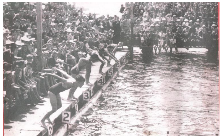
Crawley Baths Photo Credit: City of Perth Amateur SC

November 2022 saw Perth City Swimming Club move back to the home ground of Beatty Park training under its new partnership with FSC. Club members voted to revert to the historical name of the City of Perth Swimming Club to acknowledge the Club's incredible heritage during its Centenary year.